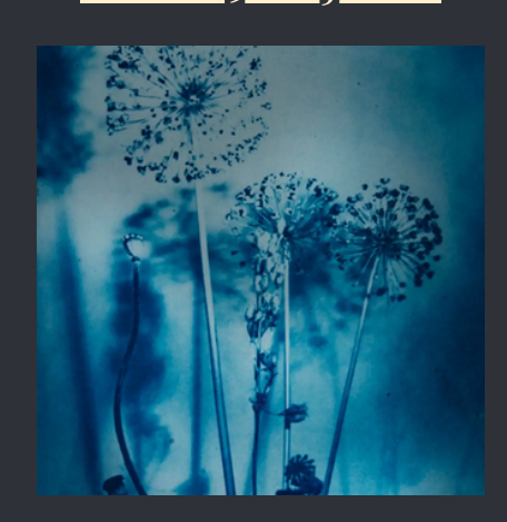
<u>Cyanotypes Workshop</u> <u>with Alan Bennington</u> <u>DAY TWO</u>