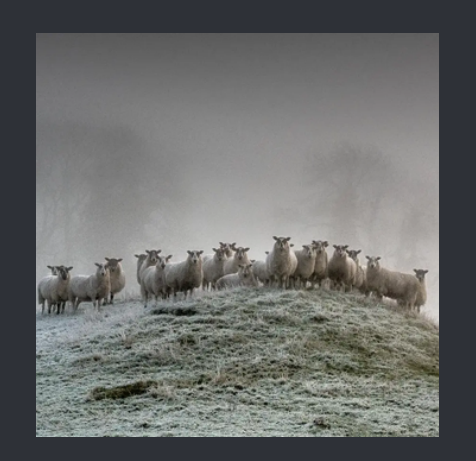
'Rural Life' Exhibition Open Daily