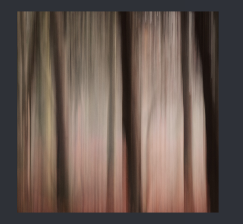
Photography Convention DAY ONE