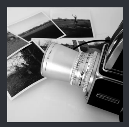
Medium Format and Beyond with lan Biggar DAY TWO