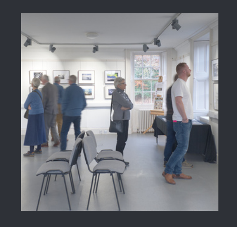
Rural Life Exhibition Private View 6-9pm