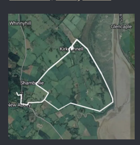
Photography Expedition with Keith Walker DAY TWO