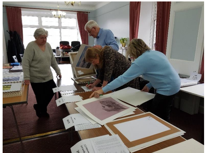
The Audience taken from the Balcony, and Print Sorting in the Back Room.