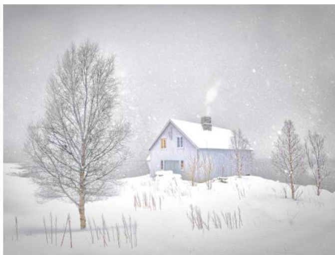
L-R